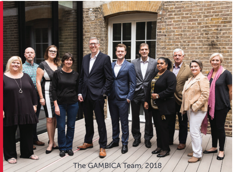
The GAMBICA Team, 2018

When GAMBICA was first formed in 1981, the abbreviation stood for the Group of Associations of Manufacturers of British Instrumentation, Control and Automation. However when the BLWA was integrated in 2001, the abbreviation stopped being used and now GAMBICA is simply used as the name of the association.